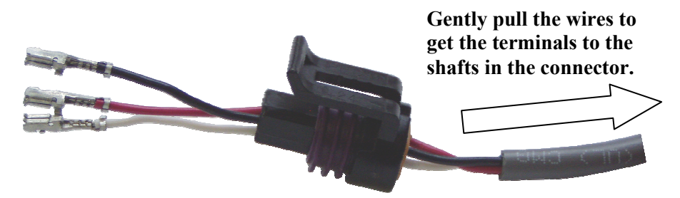
Fig.1: Preparation of the connector

NOTE: Check that the yellow connector seal is not slidden out from the connector.